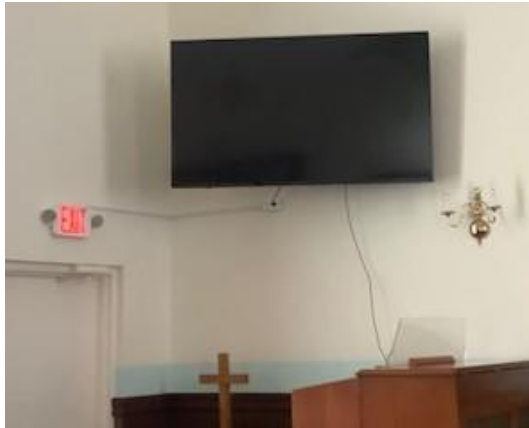
New tv for our sanctuary to show announcements, videos, DVDs, meditations, movies, etc