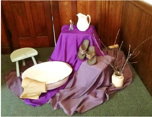
Lenten Display in our entry