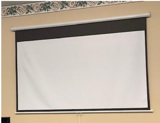
New screen in Fellowship Hall to show movies, DVDs, etc