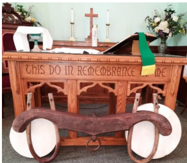
Our altar in July!