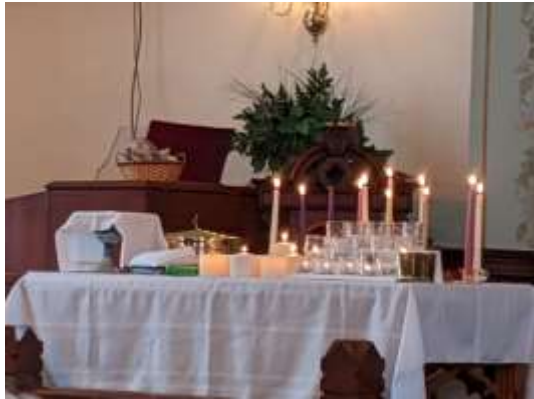
All Saint's Day Altar