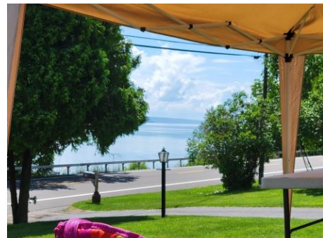
The view during Worship at the Lake