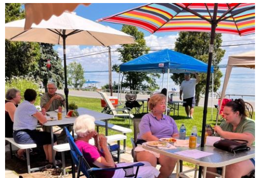
"Worship on the lake!"