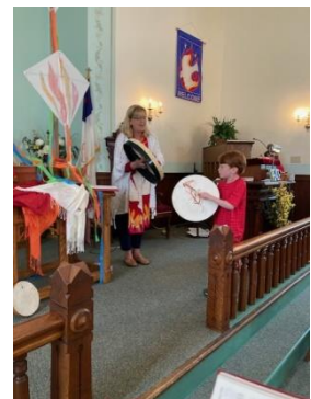
Our sanctuary on Pentecost Sunday!