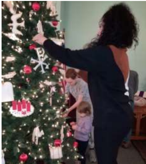
Decorating the Sanctuary Tree