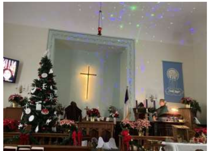
Our Christmas Altar