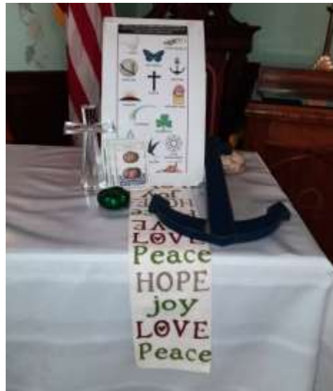
1 st Sunday of Advent Alter