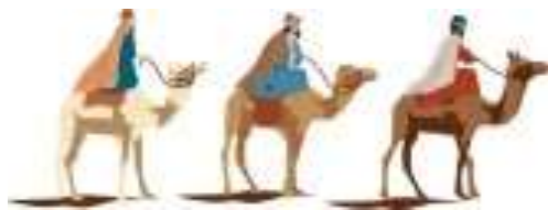
Epiphany is January 6th

It is an eye opener, & you will not forget this story.