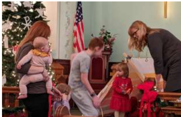
Children's Time on Christmas Eve