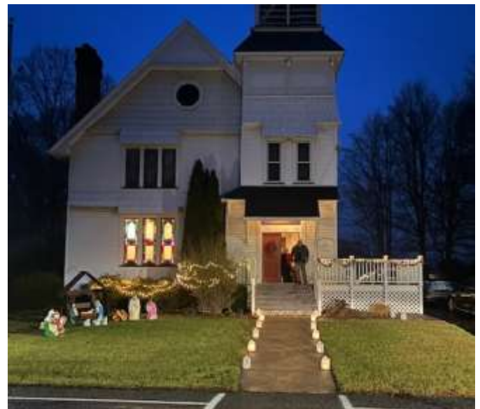
Our Church on Christmas Eve