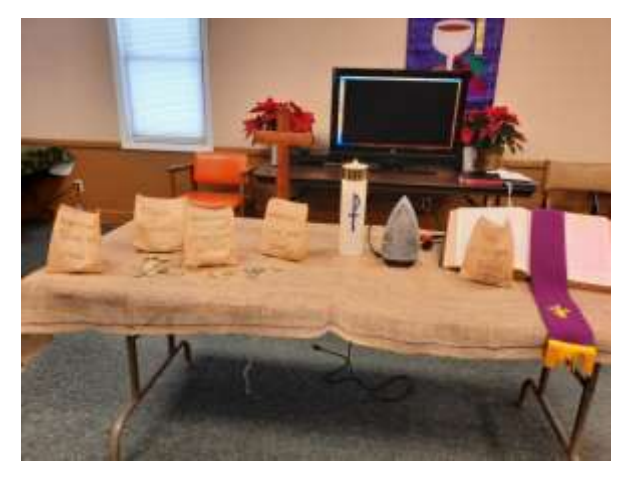
What are your temptations to keep you from walking the holy path? Where do you find calm to think about your faith journey--maybe a routine quiet activity, such as ironing?