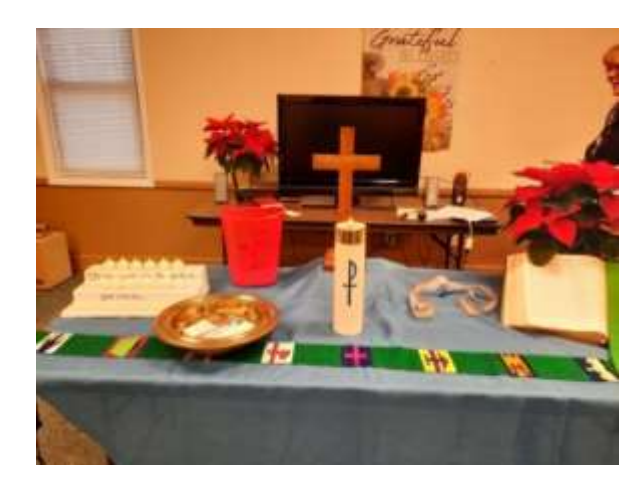
Trash your sins, repent because Jesus is the light of the world