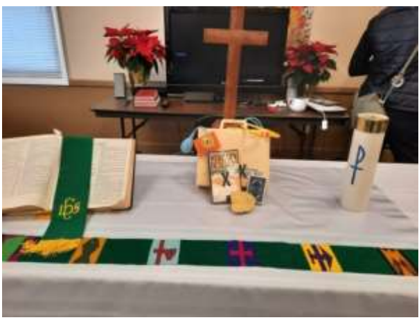
Jesus didn't need a medical kit, medical words nor tarot cards to heal