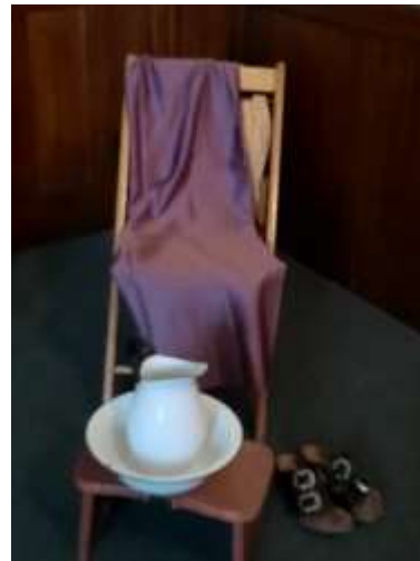
Maundy Thursday preparation commemorating the washing of feet & the last supper.