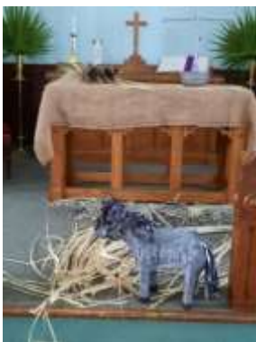
Palms on Palm Sunday

t's " time for the Son of Man to be glorified ". What are the clues? What is our clue to understand the moments where we need to step it up & honor God? John 12:26 & the listing of our Missions were provided to parishioners. This Sunday the scripture also say that Jesus talked about the grain of wheat that has to die to be more than it is. Therefore the food with seeds, the bread made from wheat.