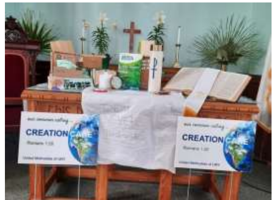
Festival of God's Creation