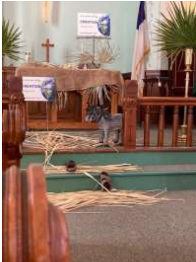
Our Palm Sunday Altar