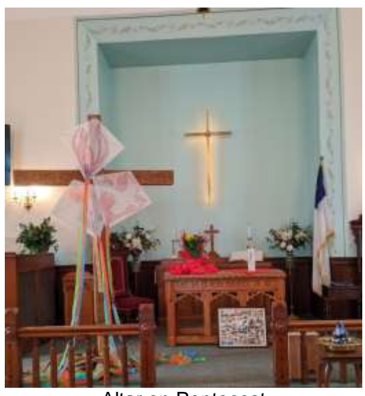
Altar on Pentecost