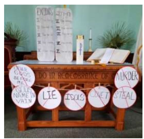
Working our way through the Ten Commandments