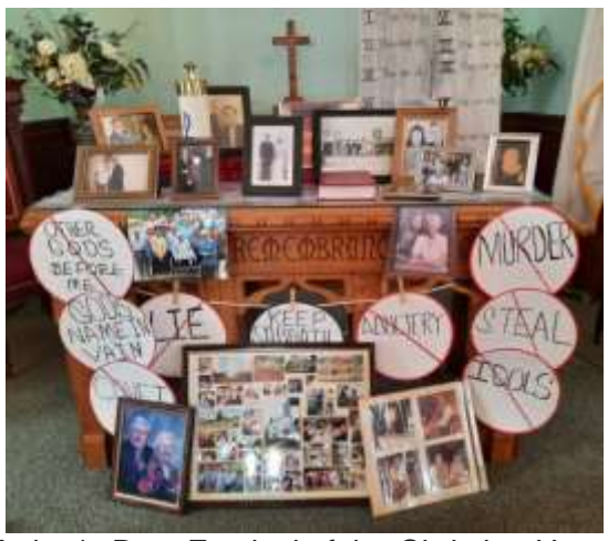
Mother's Day, Festival of the Christian Home, Continuing with 10 Commandments