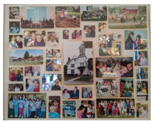
Framed Photos from 1999 in our Pentecost altar display