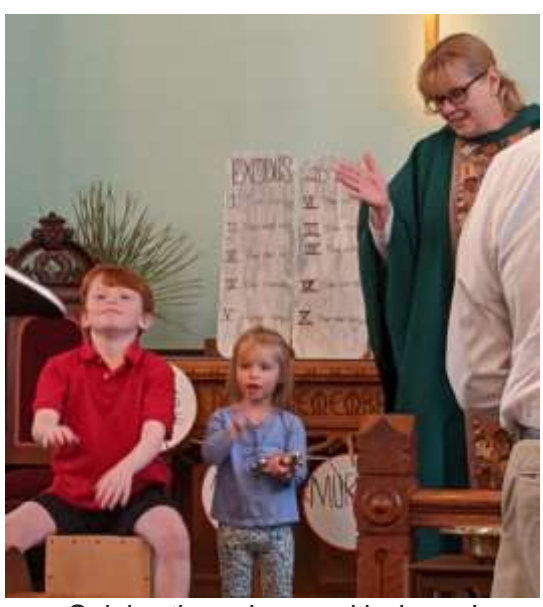
Celebrating a hymn with drums!