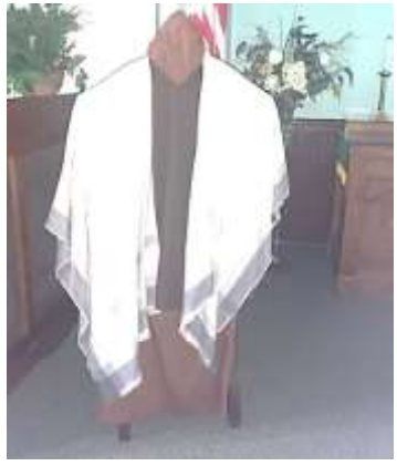
Jesus compassion and healing – The hem of his robe & voice restored 2 women to life