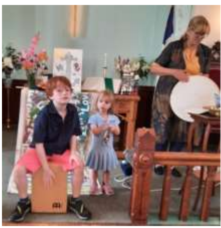
joining in the hymn "People Need The Lord"