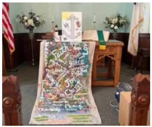
"Hope is my anchor!"