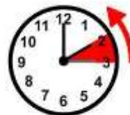
daylight saving time ends