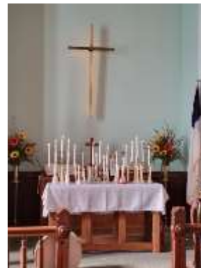
All Saints' Day Altar