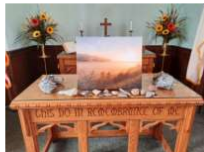
Creation Care Sunday Altar