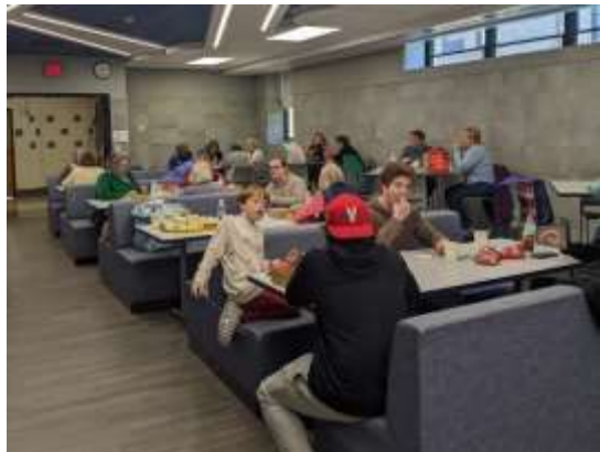
Happy Lunch Customers