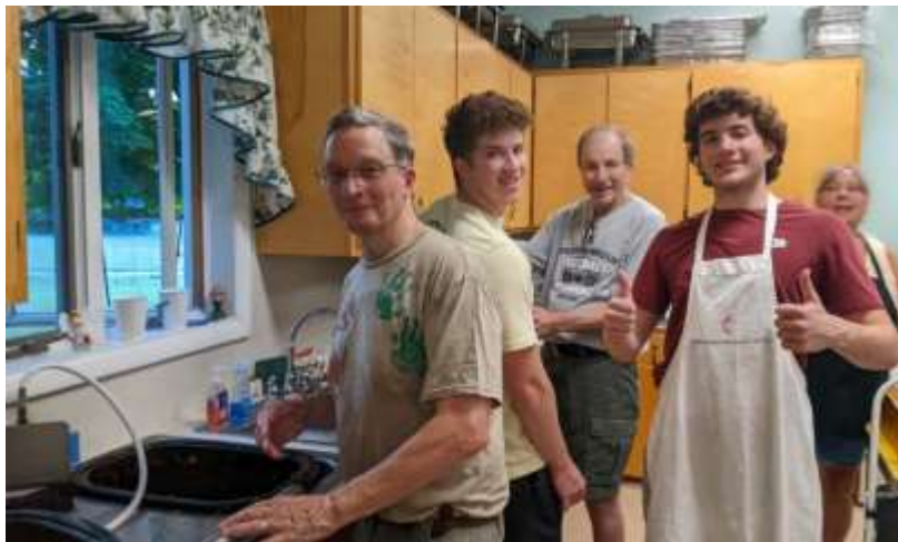
Our Dish Washing Crew!