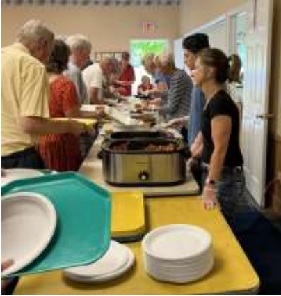
Start of the Serving Line