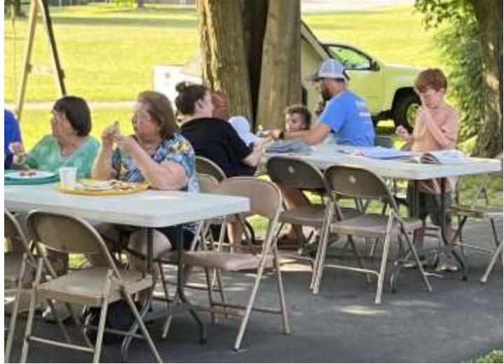
Enjoying eating outside!