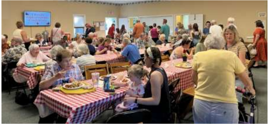
Enjoying eating inside