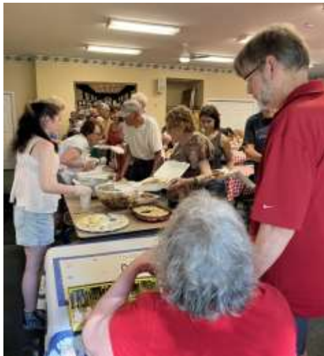
End of the Serving Line