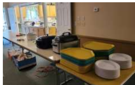
We're ready! Bring on the people!