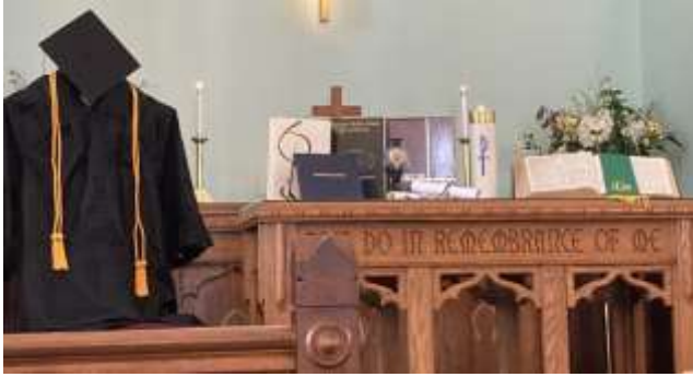
Altar on Graduate Recognition Sunday